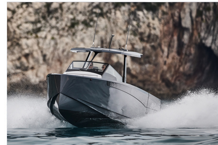
Pioneering Petestep® hull design ensures unmatched speed, stability, and silence on the seas

But it's not just about speed and silence. The V10's hull, optimized with four Petestep deflectors, ensures stability, even in choppy waters. This presents boaters with a riding experience that's unparalleled in its class, offering both comfort and safety.