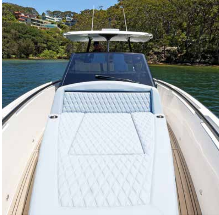
Above: The Virtue V10's foredeck is a sunbaking paradise with adjustable pads and drink holders.